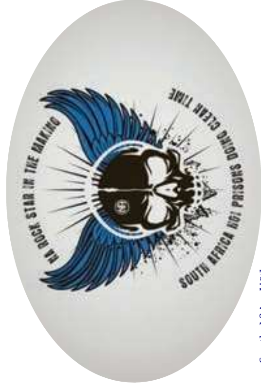
South Africa H&H