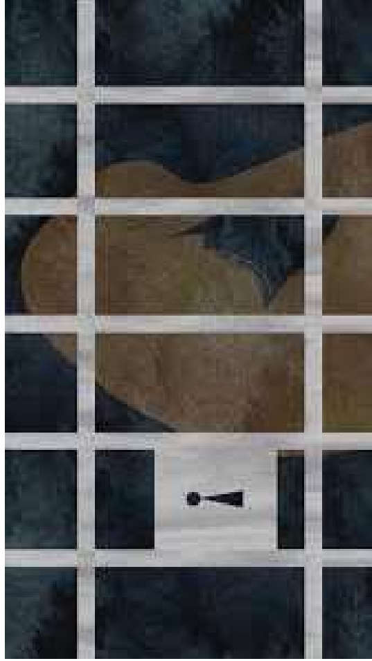
Anonymous Inmate Art

If you would like to see your art printed here, please send jpegs or pdf files to Handl@na.org , or mail to Reaching Out; c/o NA World Services; PO Box 9999; Van Nuys, CA 91409.